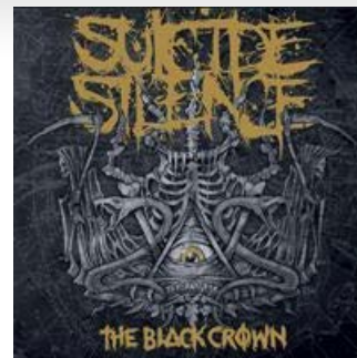
Suicide Silence The Black Crown